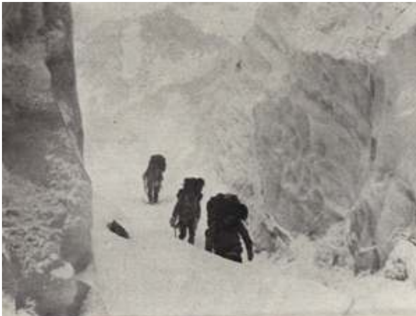
"Crossing the Ice fall"

On two or three occasions we had total 'white-out' when we could not see anything at all. I, as lead climber, could not even tell whether I was going uphill or downhill, left or right, and the others in the rear had to guide me. (At one stage we found ourselves on a steep rock face covered thinly with snow and if anyone had lost his balance, we would all have fallen. At 11 p.m. we were still walking and finally took shelter in a disused alpine cable car station half way to the hut we intended to reach and camped in the old house, formerly used by the maintenance men. It was full of snow but we cleared an area for sleeping and lit a fire using odd bits of wood gathered from the inside of the building.