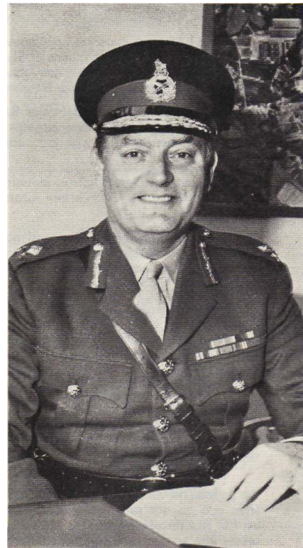
The Colonel of The Regiment